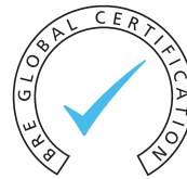
Scheme Details Cert/Ref No.

Rules and Guidance for the reproduction of each of the marks are given on the pages that follow