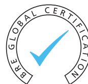
Assessed to ISO XXXXX Cert/Ref No.

For management system schemes that are UKAS accredited