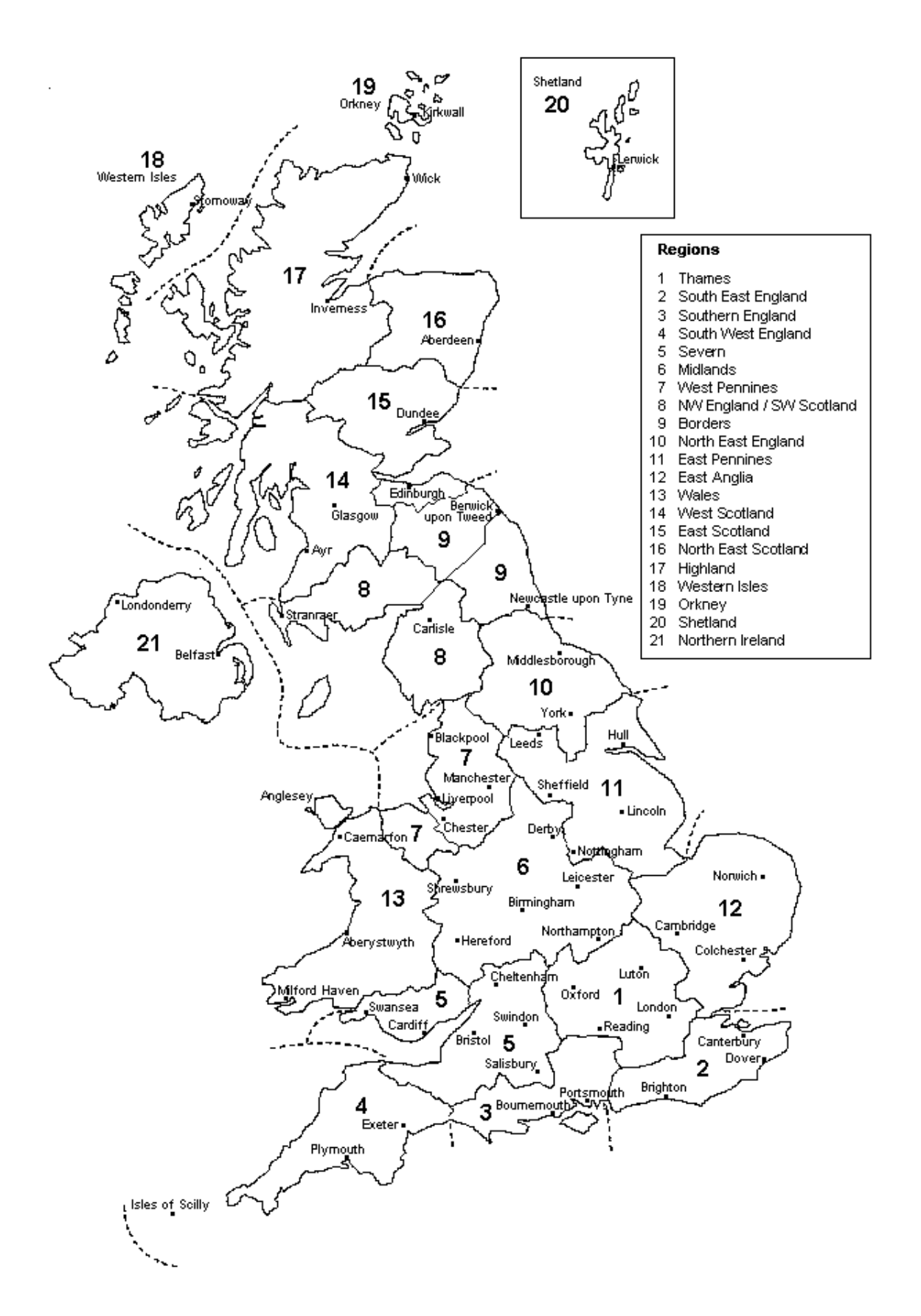
Figure 2: Climate regions