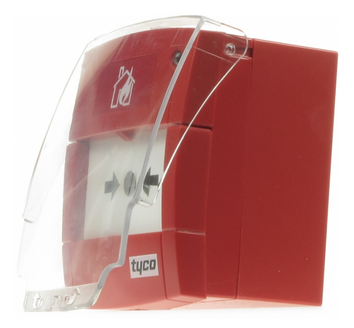
PHOTO 1: Manual Call Point fitted with a protective cover

There are a number of assumptions that have been made in generating the proposed interventions in Table 4 using the data in Appendix A. Most importantly there is the assumption that the proposed interventions would actually work in the field however as a first step they would be worth implementing. Also with limited information for some false alarm activations the proposed solutions may not work. The data does indicate the kinds of causes that are being observed in the field and offers solutions that may reduce false alarm more generally.