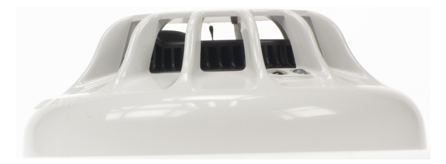
PHOTO 2: Optical/heat multisensor detector

However replacing with an enhanced optical smoke and heat multisensor would most probably resolve the false alarm issue. Note that when more than one fire signature (such as heat and smoke) is present the enhancement algorithms within the multisensor can adjust the sensitivity levels generally making them more sensitive. There are few false alarm sources (as can be seen from the list in Appendix A) that produce both smoke and sufficient heat.