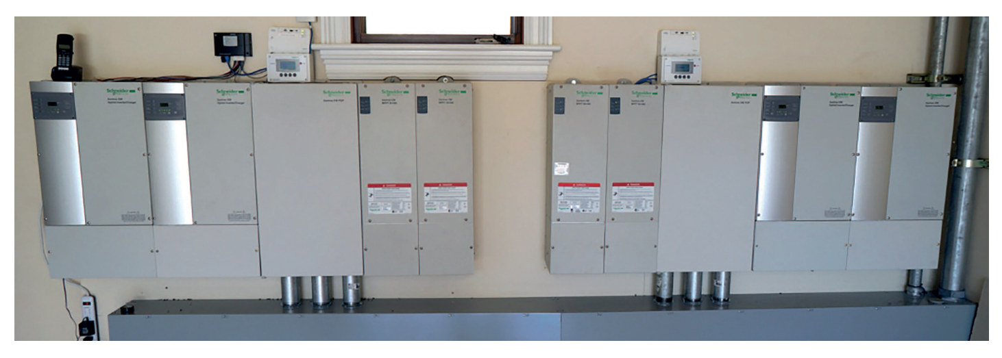
Image: Schneider Electric, a domestic installation for a large house or small commercial application

Cover images are from Fronius and Victron (image of domestic solar storage system at BRE Innovation Park at BRE, Garston, Watford, see www.ipark.bre.co.uk )