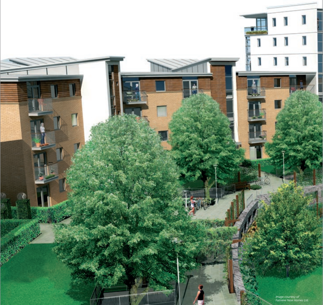
Image courtesy of Fairview New Homes Ltd.

For a smoother path through the planning process: